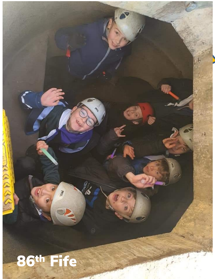
86 th Fife

Our Cubs had a fantastic activity day at Fordell Firs in May. All our sections have been extremely busy this year with their programme and as a result, we awarded a whopping 267 badges across the Group, ranging from the Beavers Money Skills Badge to the Scouts Global Issues Badge.