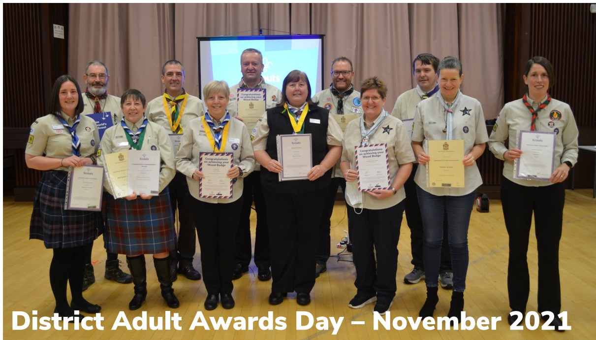
District Adult Awards Day – November 2021