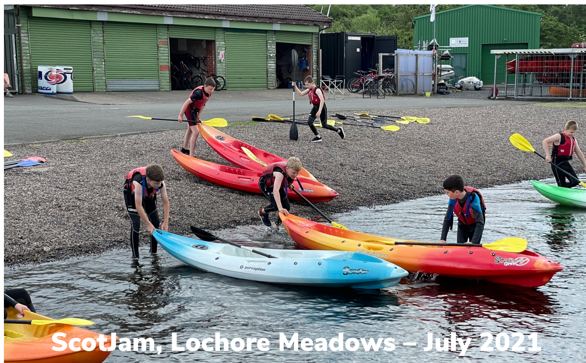
ScotJam, Lochore Meadows – July 2021