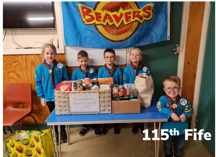
115 th Fife

All sections welcomed new members, achieved a wide variety of interest badges, Chief Scout Awards and Wood Badges, as well as continuing with our support of Kirkcaldy Foodbank through various activities and challenges