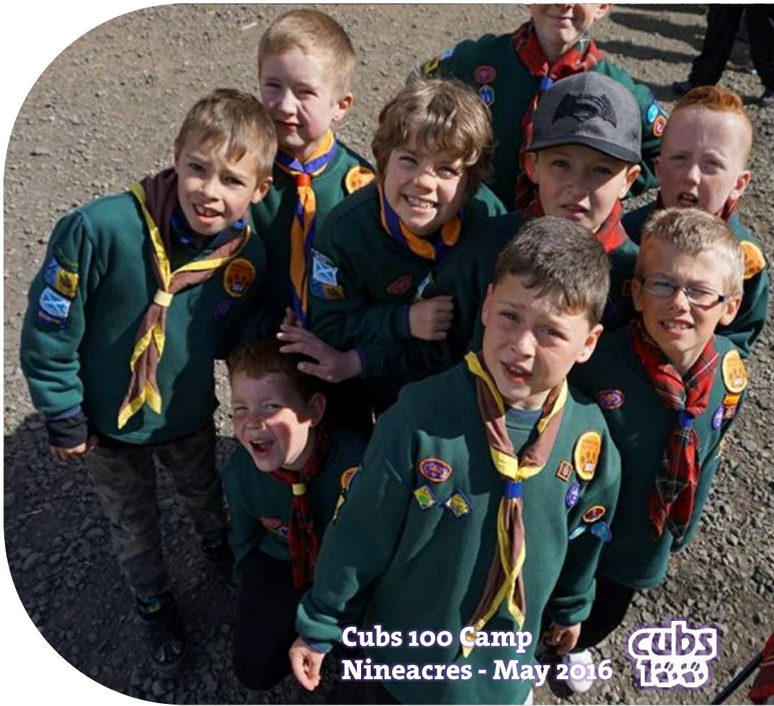
Cubs 100 Camp Nineacres - May 2016