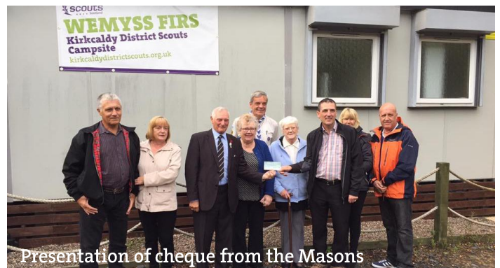
Presentation of cheque from the Masons

We were awarded funding from the Wemyss Charitable fund and received a donation from the Masons which allowed us to replace the ageing cooker with a shiny new commercial range cooker. Our sincere thanks go to them for their support.